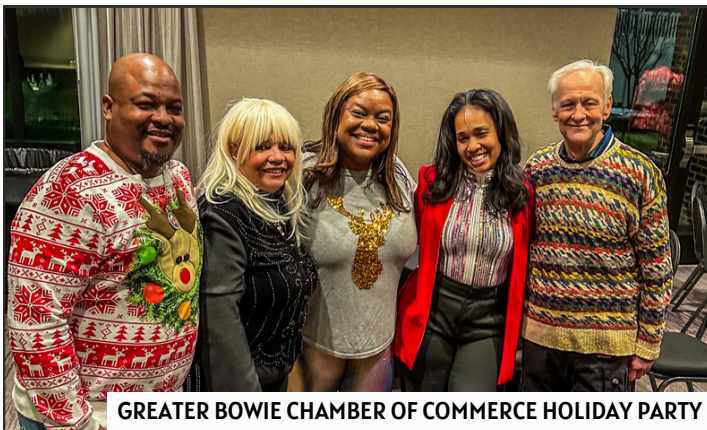
GREATER BOWIE CHAMBER OF COMMERCE HOLIDAY PARTY